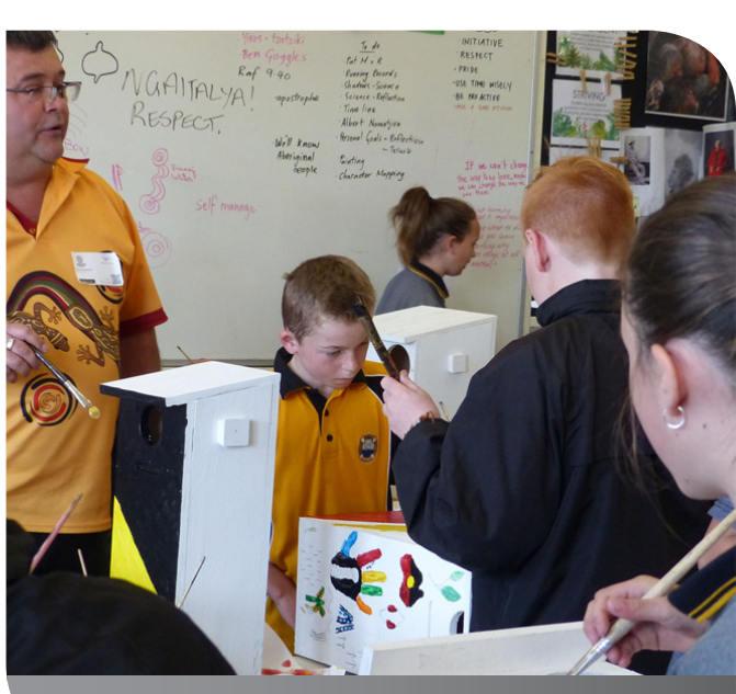
Brighton Primary School students painting nesting boxes

Throughout these construction works, it is important to recognise that local businesses will remain open and require the ongoing support of the community and those employed on the project, to assist in the growth and success of the local business network.