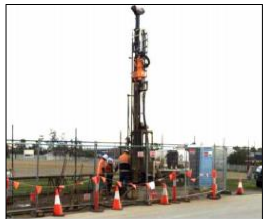
Example of a site setup and drill rig

The testing crew will monitor noise and disruption throughout the investigations program and will make every effort to minimise the impact to the adjacent community. Following completion of each investigation, the site will be reinstated.